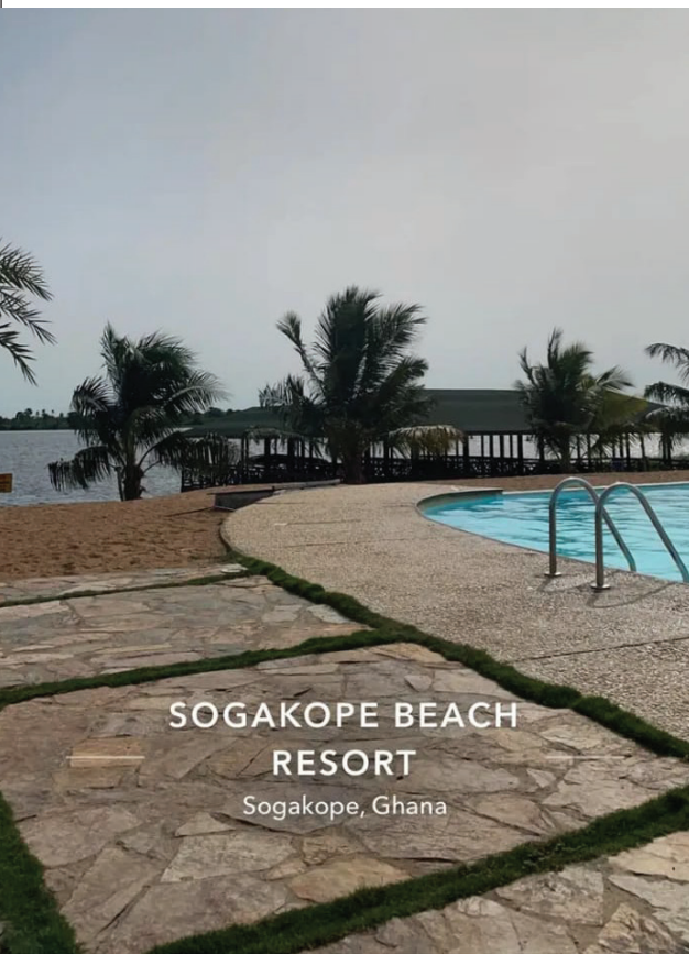
SOGAKOPE BEACH RESORT Sogakope, Ghana

Whether you seek a romantic escape, a family adventure, or a serene business retreat, our modern, African-inspired resort promises a perfect blend of elegance and comfort, making every moment truly special. Discover a world of luxury and tranquility along the scenic banks of the famous Volta River.